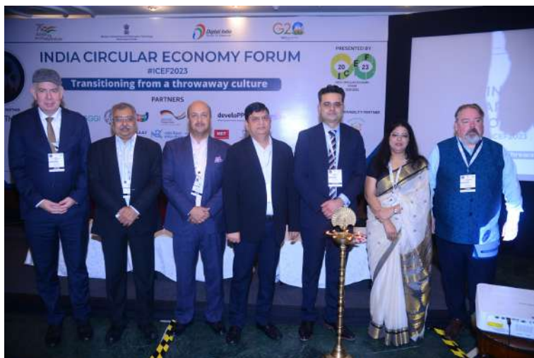
Inauguration of ICEF2023