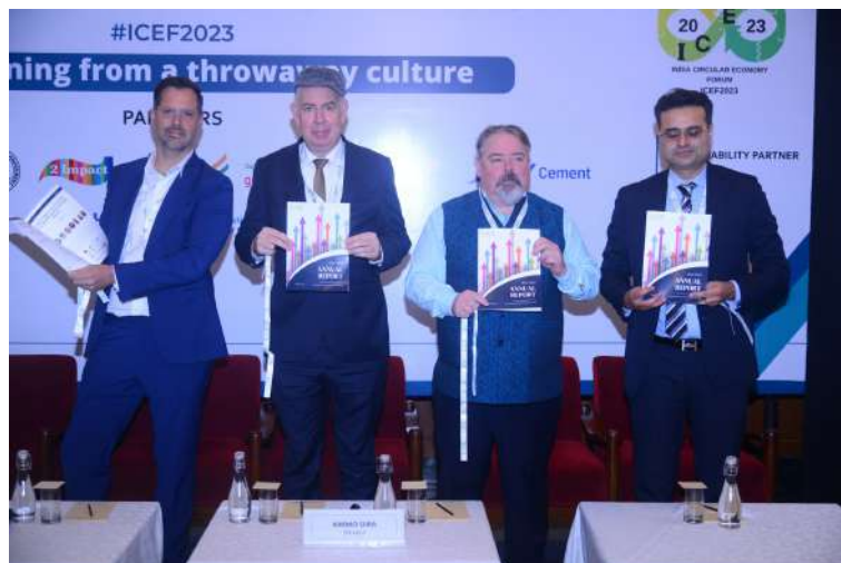
Release of third Annual Report of ICCE